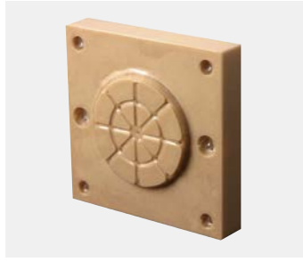
Figure 3: The PEEK sheet conforms to the part's shape while smoothing its surfact